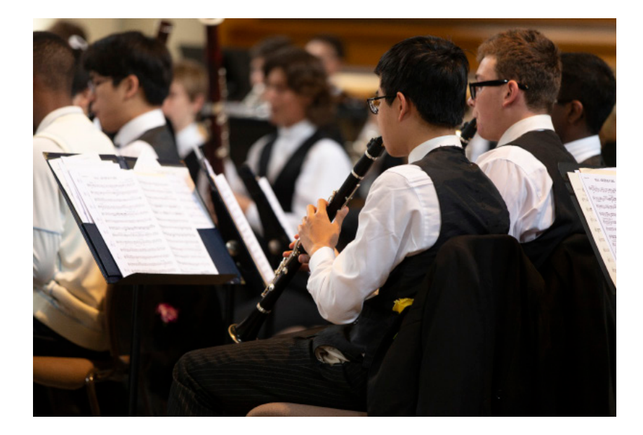
We believe that our pupils learn as much, if not more, outside the classroom as within it.