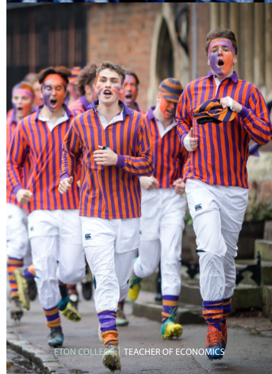
ETON COLLEGE | TEACHER OF ECONOMICS